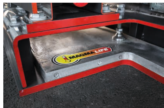
Heats up nearly 60 % quicker – unique MAGMALIFE heating system.