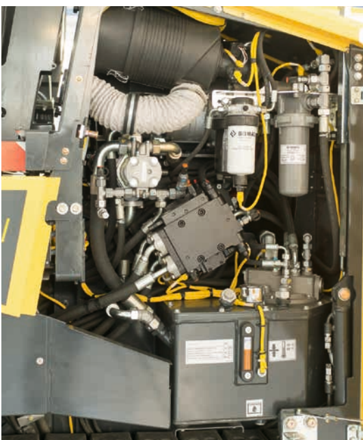
Save up to 17 % fuel – demand-driven hydraulics – with BOMAG ECOMODE.