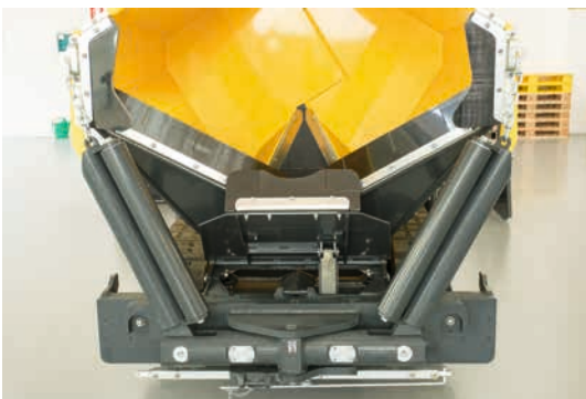
Hydraulic front gate – for a clean material flow.