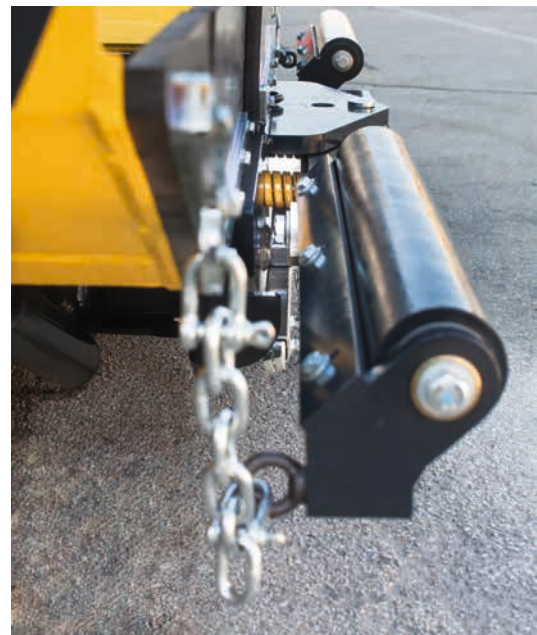
Impact-free docking – dampened bumper.